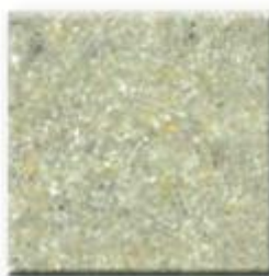
apple green 600

Storage: The handling-regulations for highly flammable materials apply to methacrylate – resins. Plastifloor® resins are to be stored cool, protected against direct sunlight and preferably at temperatures of 59 - 68 °F. During storage paraffin – particles and filler – materials may precipitate. Thus before processing, containers have to be stirred up well. Please mind the advice on our safety data sheets.