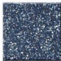
north sea 520