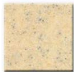
beach sand 103