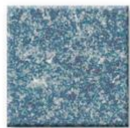
light blue 501